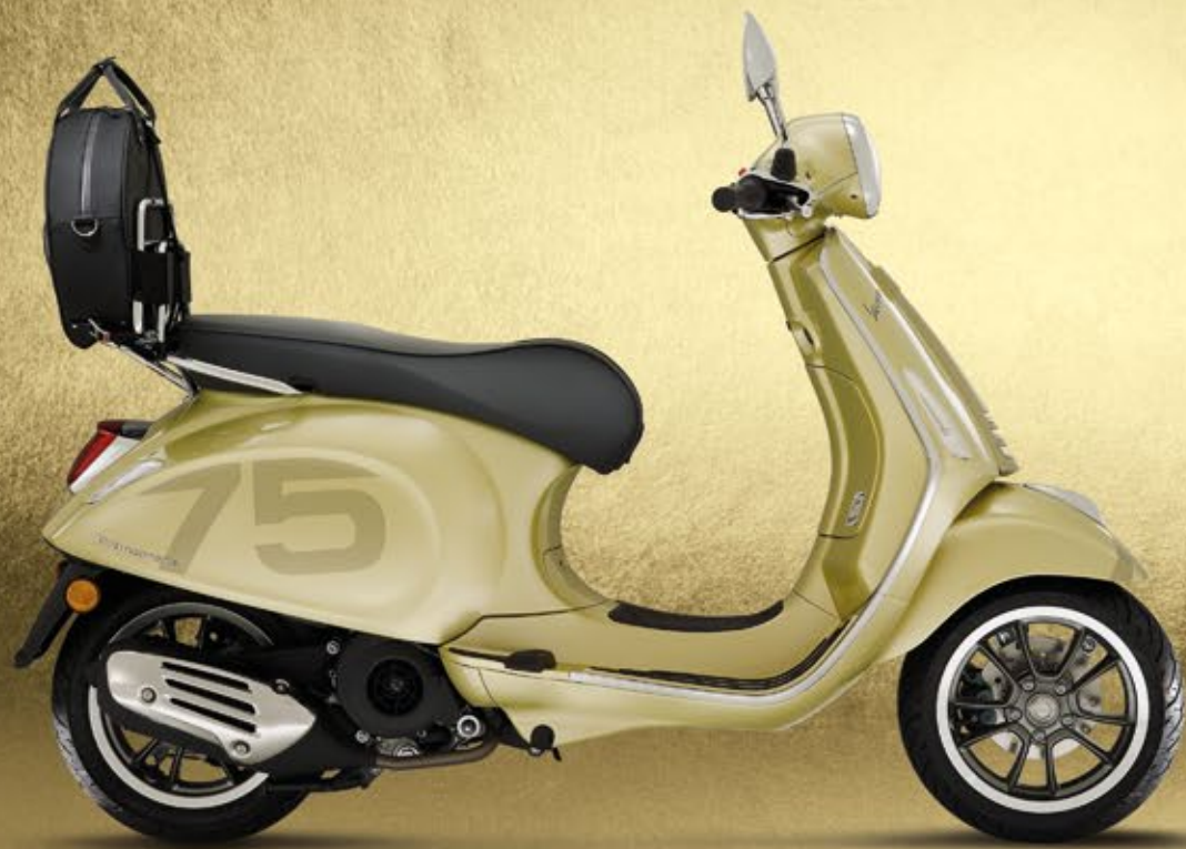
VESPA PRIMAVERA 75th