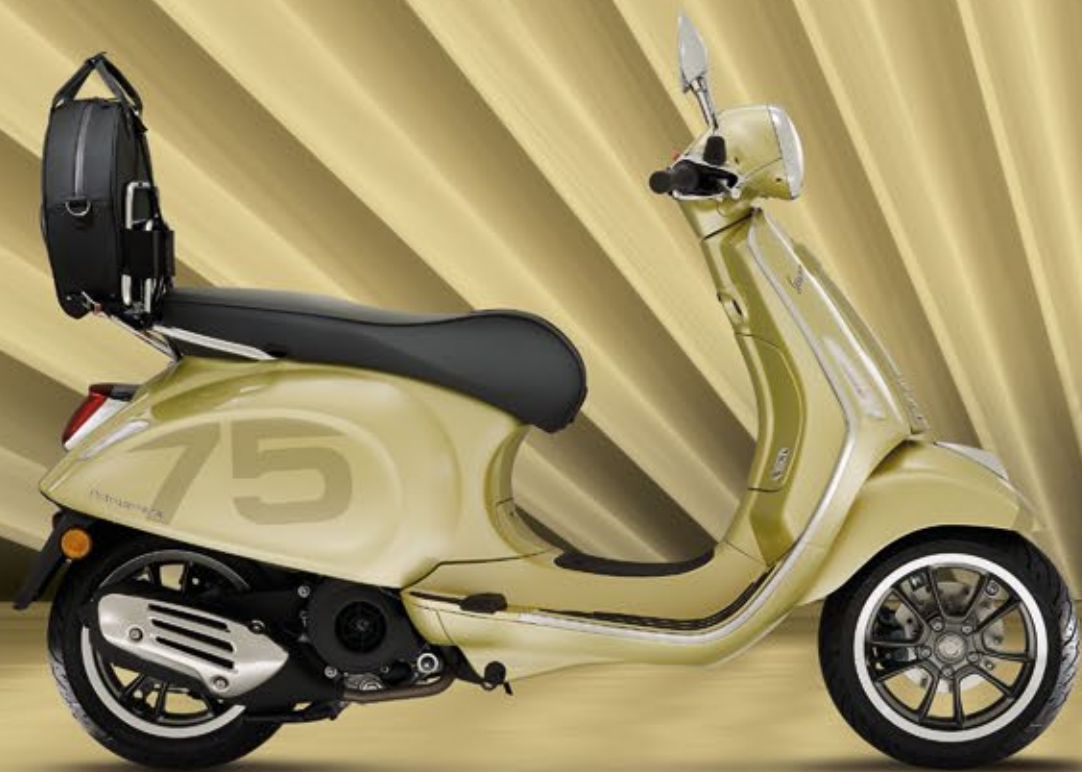
VESPA PRIMAVERA 75th