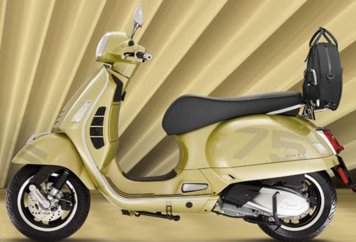
VESPA GTS 75th