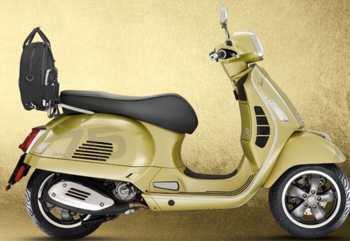
VESPA GTS 75th