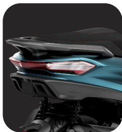
NEW DESIGN WITH ULTRAMODERN DESIGNS