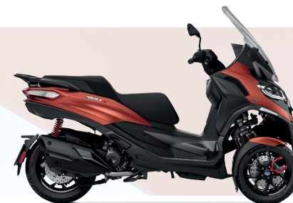
ARANCIO SUNSET MATT