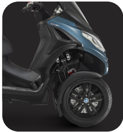
COMPACT GT DESIGN