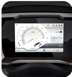
DASHBOARD WITH 7" TFT DIGITAL DISPLAY