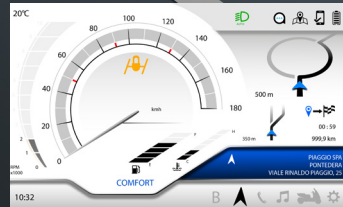
NAVIGATION SYSTEM (ONLY ON MP3 530 HPE AND MP3 400 S)