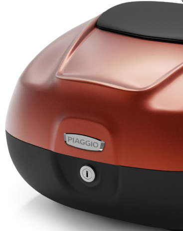
TOP BOX 37 I