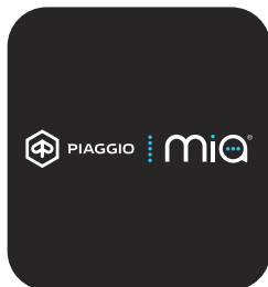
ADVANCED CONNECTIVITY WITH PIAGGIO MIA ON BOARD