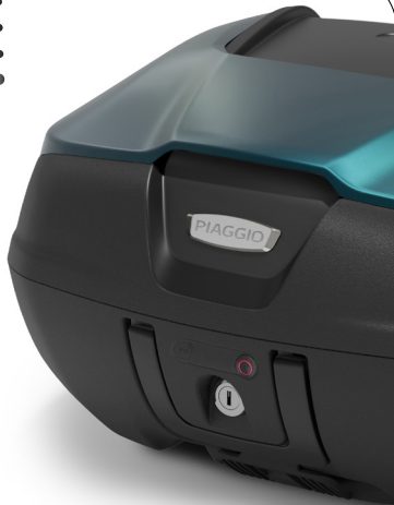
TOP BOX 52 I