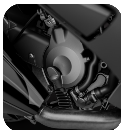
400 CC EURO 5 ENGINE