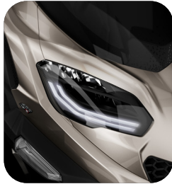
FULL LED LIGHTING SYSTEM