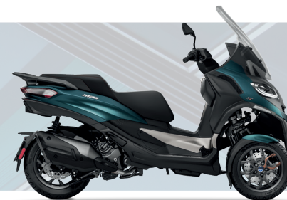
BLU OXYGEN MATT