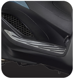
METAL FOOTPLATE COVER