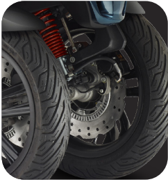
WAVE BRAKE DISCS