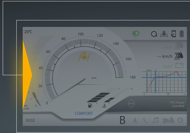
BLIS - BLIND SPOT INFORMATION SYSTEM (ONLY ON MP3 530 HPE)