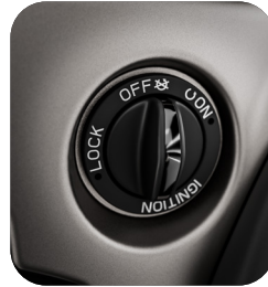
NEW KEYLESS SYSTEM