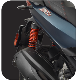
RED COIL SPRINGS