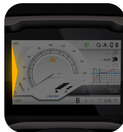
BLIND SPOT INFORMATION SYSTEM