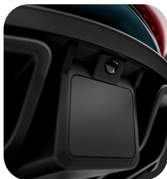
REVERSE DRIVING WITH REAR CAMERA