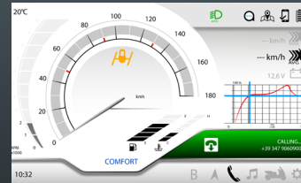
SMARTPHONE CONNECTIVITY (ONLY ON MP3 530 HPE AND MP3 400 S)