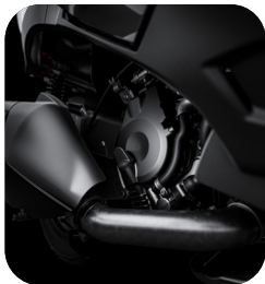
EURO 5 ENGINE