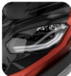
NEW LED DRL HEADLIGHTS