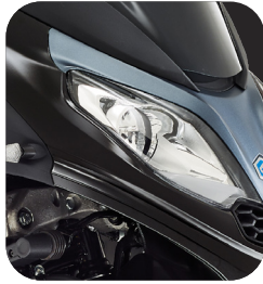
DRL LED HEADLIGHTS