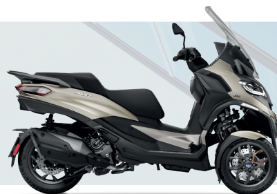
GRIGIO CLOUD MATT