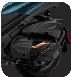
NEW 530 CC EURO 5 ENGINE