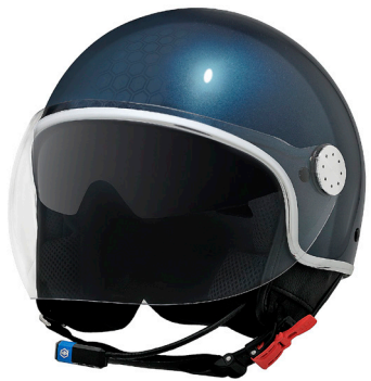
BLUETOOTH MIRROR HELMET