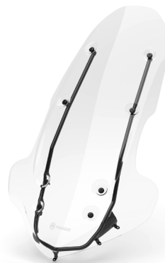
COMFORT + WINDSHIELD