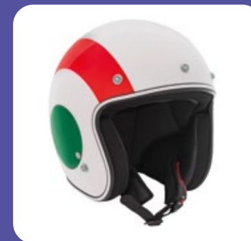
NAZIONI 2.0 HELMET