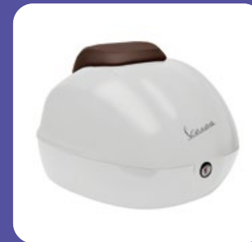
PAINTED TOP BOX