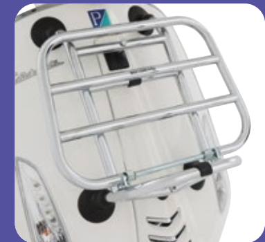
CHROME FRONT LUGGAGE RACK