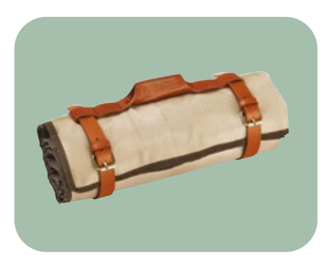
BLANKET WITH VESPA LOGO

ALL THE STANDARD FEATURE HAVE THE EXCLUSIVE LOGO OF THE EXCLUSIVE VESPA PIC NIC EDITION